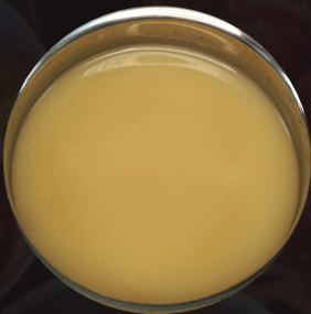
MISO Japanese style fermented soybean broth with an earthy, umami-rich flavor