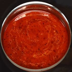
HOUSE SPICY SOUP Oppa's house special broth with a spicy garlic, creamy & tangy taste