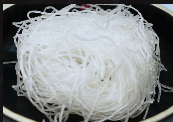
BEAN THREAD NOODLES