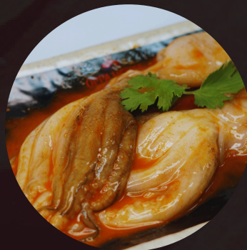
SPICY BABY OCTOPUS