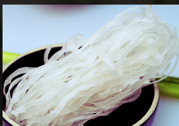
MUNG BEAN NOODLES