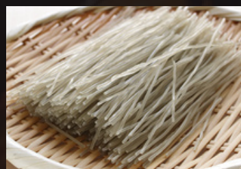
KOREAN SWEET POTATO