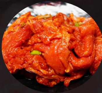
SPICY BEEF BULGOGI