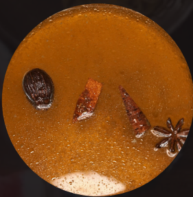
PHO A subtle, savory & light beef bone broth with aromatic spices