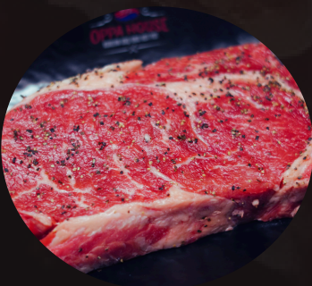
OPPA RIBEYE STEAK