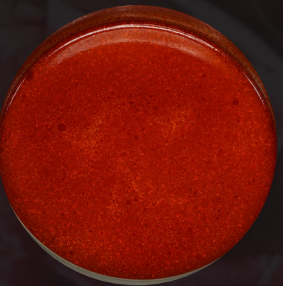
TANTANMEN A spicy & slightly creamy broth with a savory peanut & sesame flavor