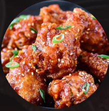
KOREAN CHICKEN WINGS