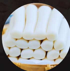
KOREAN RICE CAKES