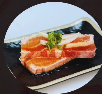
GARLIC PORK BELLY