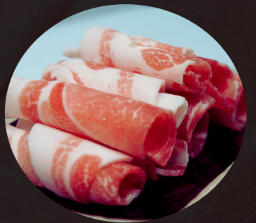
SLICED PORK BELLY