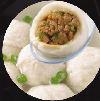
STUFFED FISH BALL