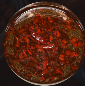
SPICY SICHUAN Fragrant & spicy broth infused with aromatic spices & numbing sichuan peppercorn