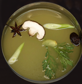
HEALTHY HERBS Light and aromatic broth infused with traditional herbs