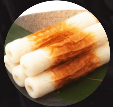
CHIKUWA FISH CAKE