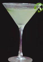
JALAPEÑOS PEACH MARTINI

Vodka, tripple sec, cranberry juice & lime juice