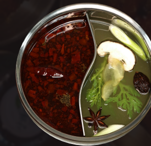
1/2 & 1/2 SOUP Choose any two different soup of your choice