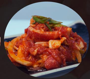
SPICY PORK BULGOGI