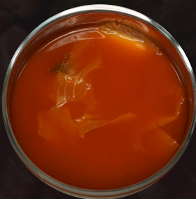
KIMCHI JJIGAE A spicy, tangy & savory kimchi flavored broth