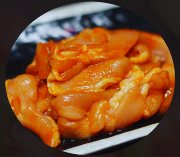
SPICY CHICKEN THIGH