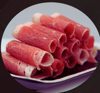
BEEF ROUND EYE