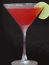
STRAWBERRY GINGER MARTINI

Peach vodka, jalapeños, simple syrup & lime juice