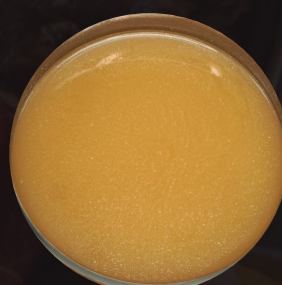
TONKATSU A rich & creamy pork bone broth with a sweet, tangy & umami undertone